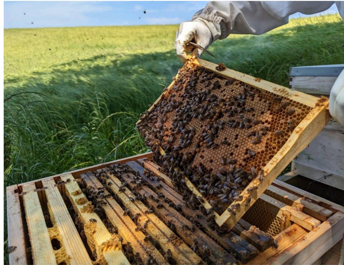
Managed beekeeping in action at the Axiom Hospitality apiary