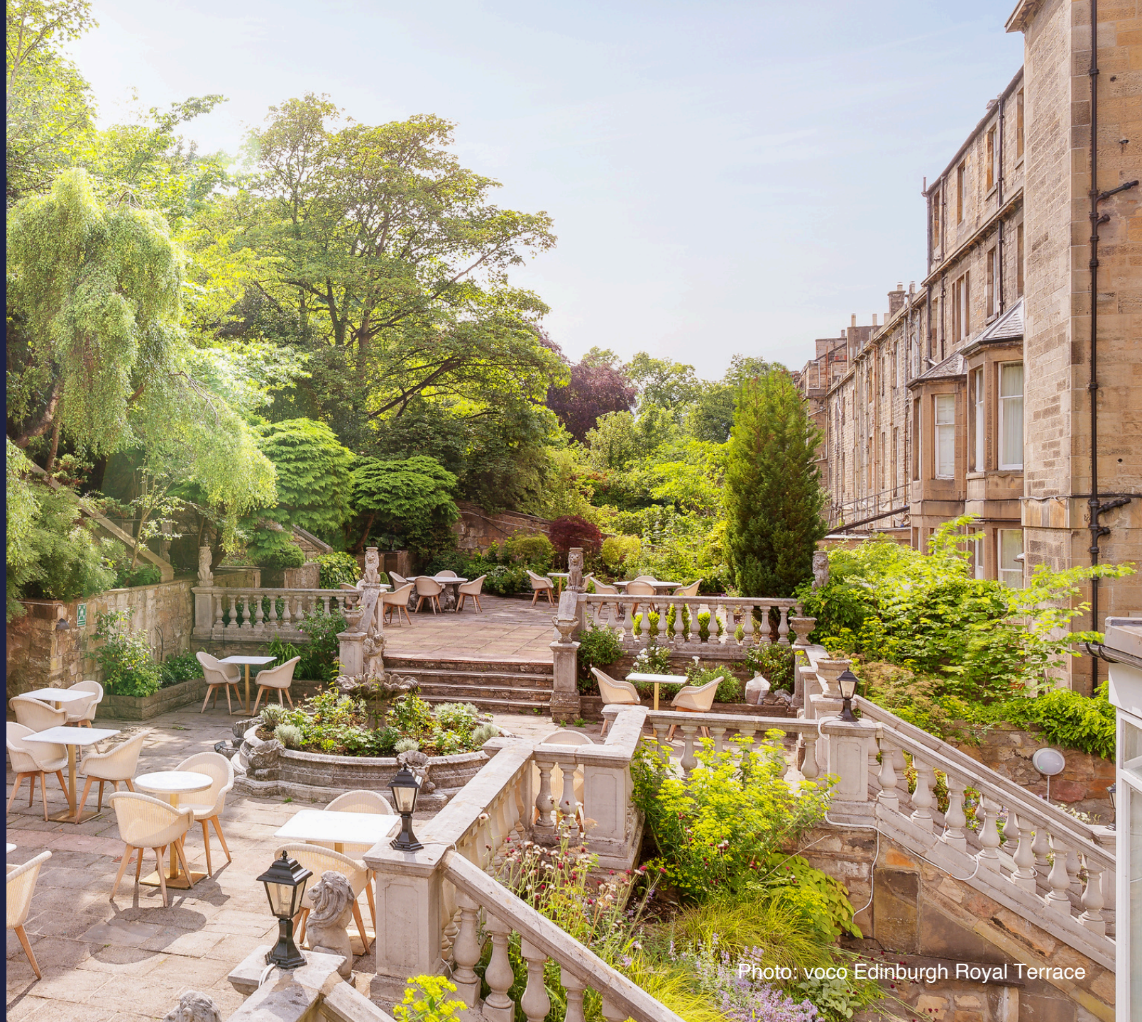
Photo: voco Edinburgh Royal Terrace